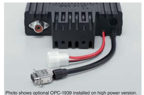
Photo shows optional OPC-1939 installed on high power version.

With the optional OPC-1939 D-SUB 15-pin ACC cable, the IC-F5023/H series can be programmed to control an operating channel from an external device (up to 16 preprogrammed channels). The ACC connector also provides an ignition sensing function, external PTT, PC command, horn honk, audio output and modulated signal input depending on programming.